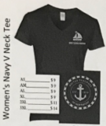
Women's Navy V Neck Tee