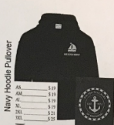
Navy Hoodie Pullover