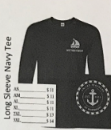
Long Sleeve Navy Tee