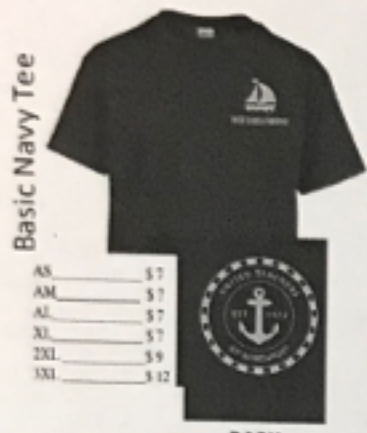
Basic Navy Tee