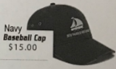
Navy Baseball Cap $15.00

Order forms due by FRIDAY, March 8, 2019