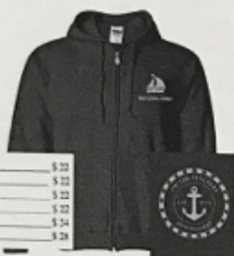
Navy Full Zipper Hoodie